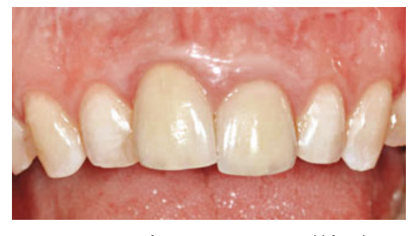
Fig 1 Progressive infraposition in a 25-year-old female patient 7 years after implant placement.

second premolars have usually reached 50 to 75% of root development and offer good prognosis for transplantation. In patients younger than 10 years with loss of permanent incisors, primary canines may represent an alternative if premolars are not available. This treatment can only be performed when there are no pronounced signs of physiologic root resorption. Compared to transplantation of permanent teeth, revascularisation cannot be expected. Therefore, a titanium post is recommended for retrograde cementation into the root canal of primary canines. This technique is additionally seen as an extension of the root for a better crown-to-root-ratio.