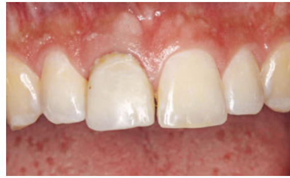
Fig 5 Case 1: Clinical situation 8 years after transplantation and reconstruction with composite of the primary canine 63 into the position of the right central incisor.

Special forceps with diamond grit reduce flipping of the tooth during removal.