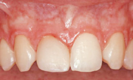
Fig 9 Case 2: Clinical situation 7 years following transplantation of tooth 44 to replace the right central incisor, successful orthodontic treatment and composite reconstruction.

Underneath the root apex, a 2 mm-distance should be maintained towards the alveolar bone. The transplanted tooth should be positioned in the socket in consideration of the optimal adaption of gingival tissue. To achieve a tight dento-gingival seal around the transplant, remnants of the dental follicle can be left around it. Also the emergence profile has to be evaluated during this positioning. It should be considered that sometimes an improved position could be achieved through rotating the transplant of about 90 or 180 degrees. The terminal occlusion should be inspected after positioning the tooth into the alveolar socket. The transplanted tooth should be set in slight occlusal contact to the antagonistic teeth or in minimal inferior position. A flexible metallic splint (e.g. TTS; Medartis, Basel, Switzerland) is fixed adhesively with phosphoric acid gel, bonding and composite to the neighbouring teeth for 2 to 6 weeks (Figs 6 to 9). The duration of splinting depends on the clinical parameters (percussion sound, periotest values). The functional occlusal impulse on trans-